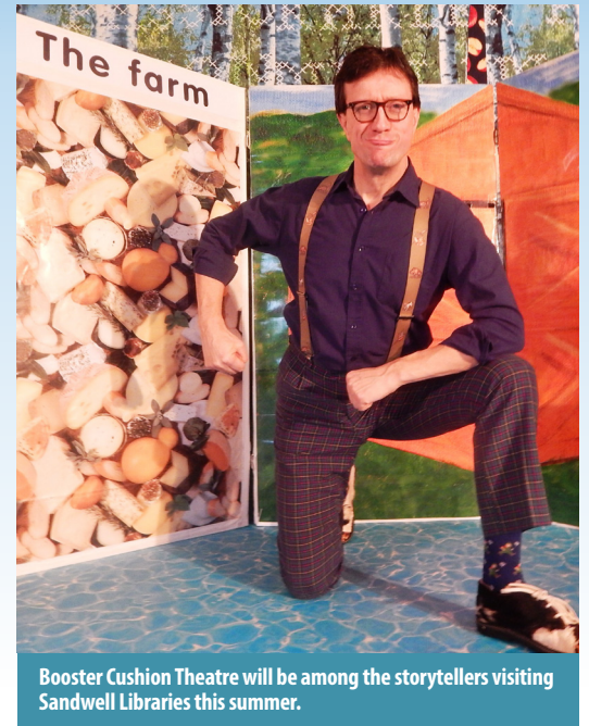
Booster Cushion Theatre will be among the storytellers visiting Sandwell Libraries this summer.

Contact your local library for their full programme – find out more at www.sandwell.gov.uk/librariesonline and www.visitsandwell.com and search 'Sandwell Libraries' on Twitter (@sandwelllibs) or search 'SandwellLibraries' on Facebook.